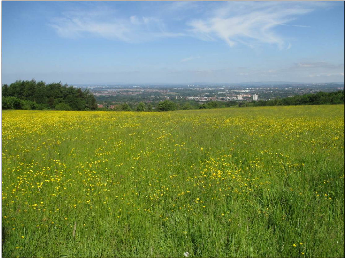
Higher Higham Meadows, June 2018.