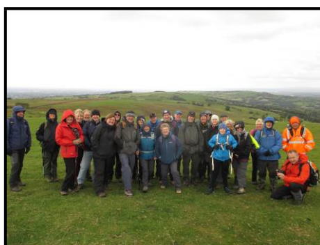
All Day Ramble Werneth Low to Cown Edge – 30 th September 2018