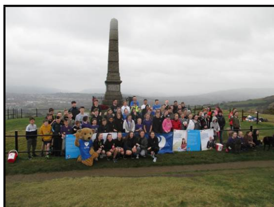
Alder Community High School run around Werneth Low for the Christie Hospital – 17 th April 2018