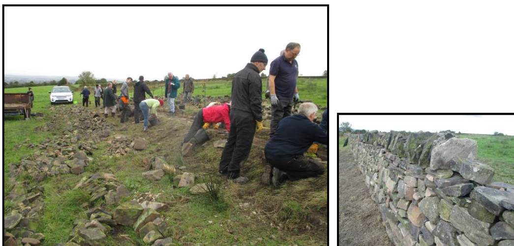
Dry Stone Walling Weekend at Rye Field Meadow September 2018